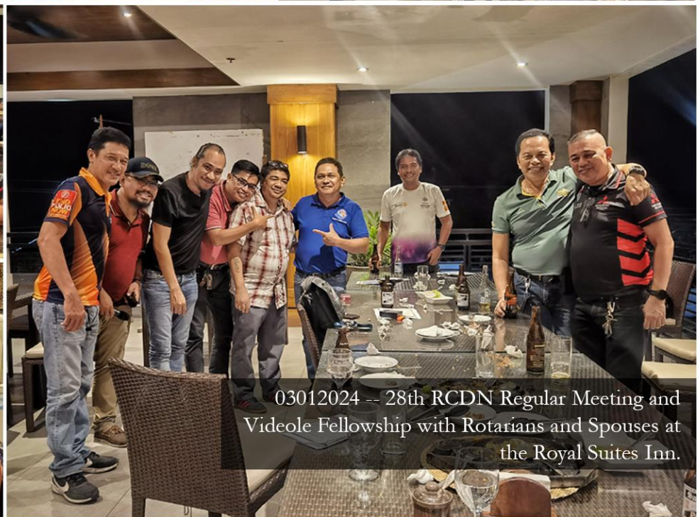
03012024 -- 28th RCDN Regular Meeting and Videole Fellowship with Rotarians and Spouses at the Royal Suites Inn.